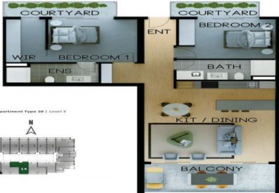
Apartment Type 10 | Level 3